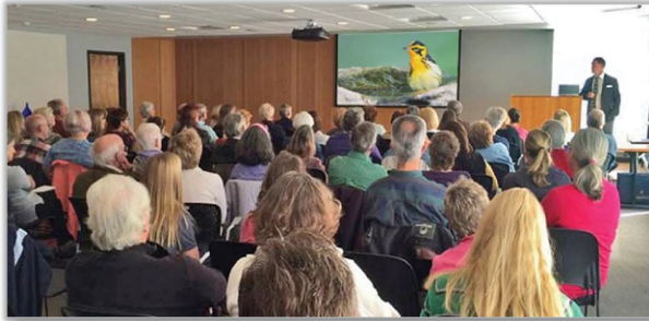
Educational Lectures and Entertaining Presentations