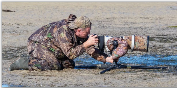
Capturing and Sharing Nature's Beauty