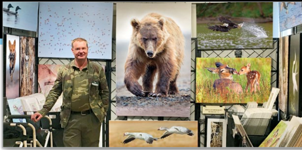
Exhibitions at Juried Art Shows and Wildlife Festivals